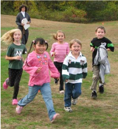
Teaticket students logging miles at recess