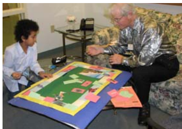
Meetings between Project RISE mentors and their students might involve games, puzzles, arts and crafts, outdoor recess or lunch, and sharing favorite hobbies, interests, and activities.

If you can spare one hour each week during the school year , or if you know someone who might be interested in mentoring, please let us know. Mentors are needed at each school , so volunteers could choose a school that is closest to their home or office. A mentor training and information session is held each month, so give us a call today and we can get you matched with a student in just a couple of weeks!