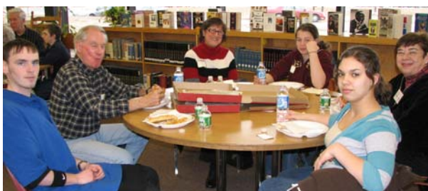
FHS mentors and their students enjoy pizza party get-togethers three times each school year, courtesy of Kosta's Pizza.